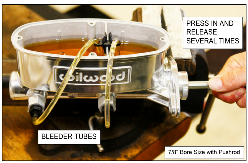
Typical Bleeder Tube Setup and Use